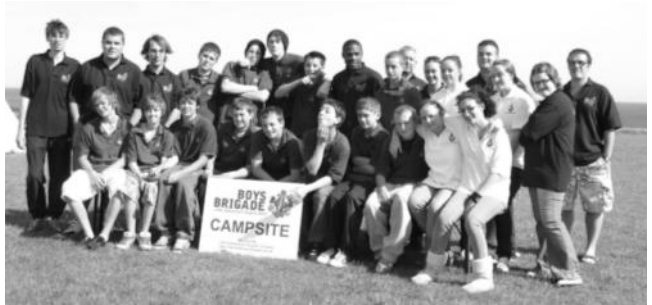
Summer Camp with the 10th Enfield to Beeston Regis, Norfolk, in 2009