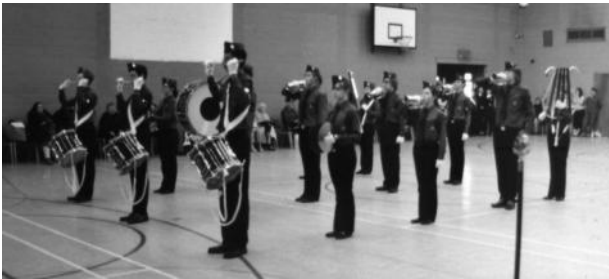
1st/3rd Enfield winning the Devonshire Cup in 2006

2002 saw the Centenary of Enfield Battalion, which was celebrated with a weekend of events in September. There were performances by the London Massed Bugle Band and the London Gym Team on the Saturday at the Enfield Town Show, and the Band was accommodated