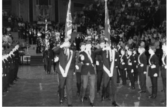
Colour Party at the very last Royal Albert Hall Display in 1987

After the BB centennial year the Company moved forward with its activities, new ventures like the Duke of Edinburgh awards were introduced. The Company entered the London District junior band competition for the first time in 1985 and won the title. The rules on the entries for The Daily Telegraph Shield competition were changed allowing for joint entries. In 1985 a combined team of the 1st and 3rd Enfield Companies entered the updated competition and won the competition. The Companies went on to win the competition a further three years. During this time a plaque was unveiled at St Paul Cathedral to Sir William Alexander Smith, very close to Lord Nelson's tomb. The 1st and 3rd provided the guard of honour for this event. The Companies also provided guard of honour for the final few Royal