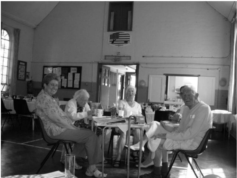
Tea and a chat

The holiday-makers enjoyed a happy, very varied programme and all had an enthusiastic go at the different activities available.