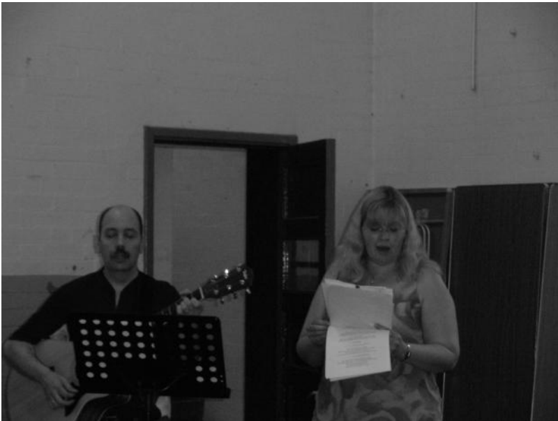
Favourite songs for everyone