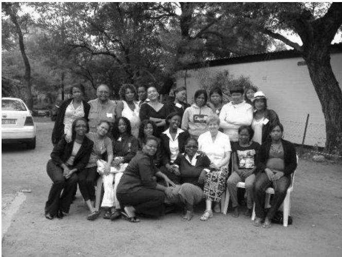
Women's group with some college staff