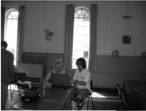
Learning about computers