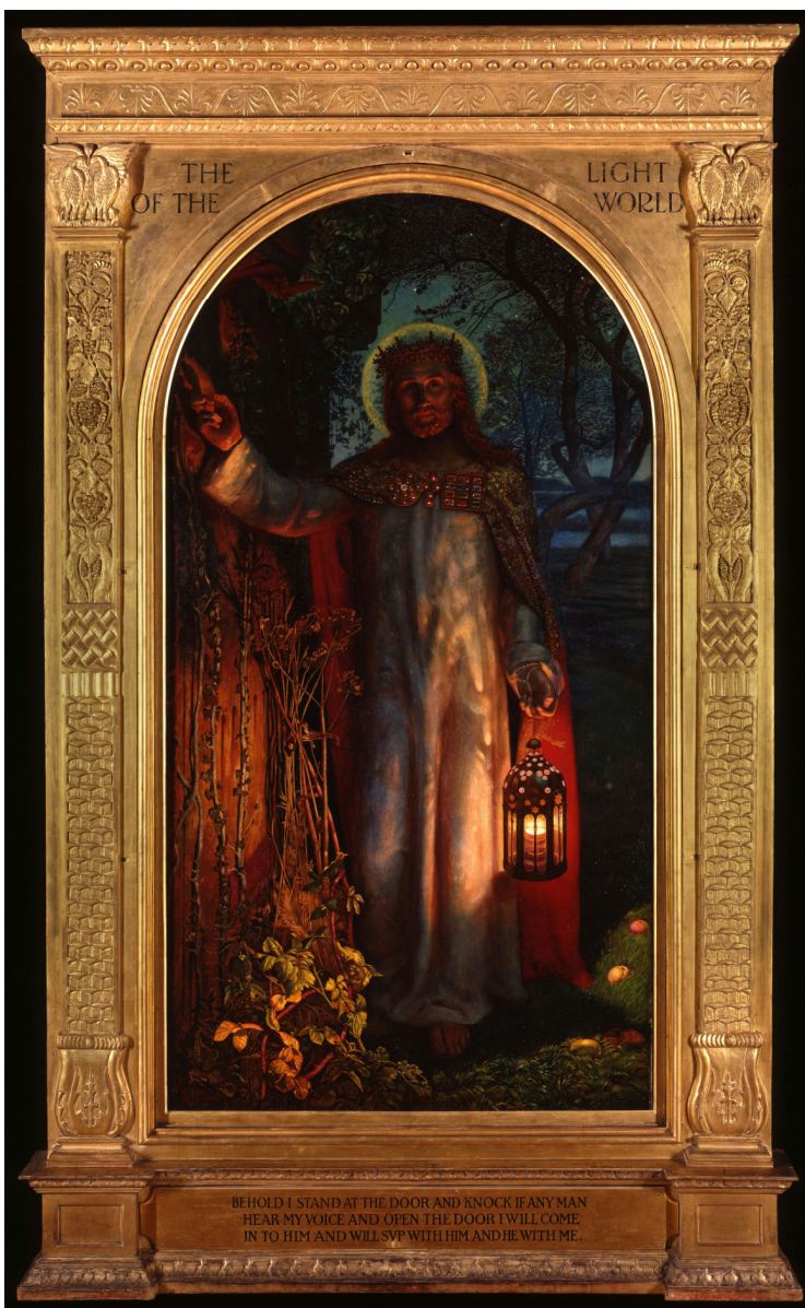
The Light of the World , William Holman Hunt 1900, St Paul's Cathedral, London. A related article by Stephen Gilburt can be found on pages 17-19.